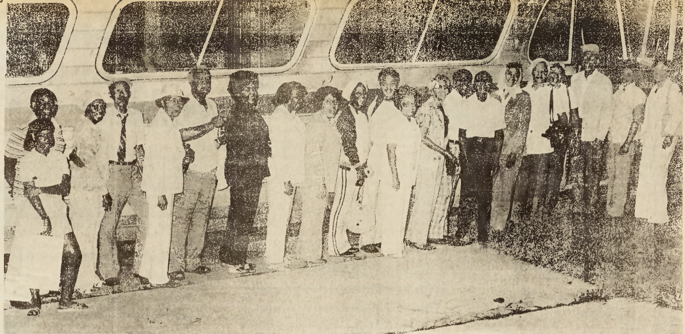
Charmalettes, Charms & Touring Friends