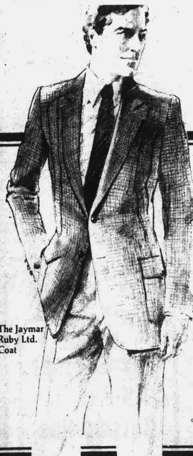
The Jaymar Ruby Ltd. Coat

BLACK VELVET® BLENDED CANADIAN WHISKY, 80 PROOF. IMPORTED BY © 1980 HEUBLEIN, INC., HARTFORD, CONN.