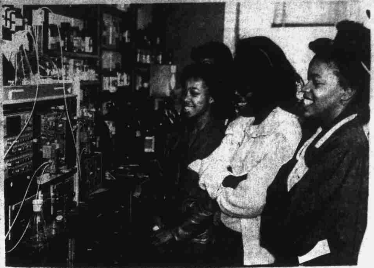
A FASCINATING LOOK at chemistry apparatus.