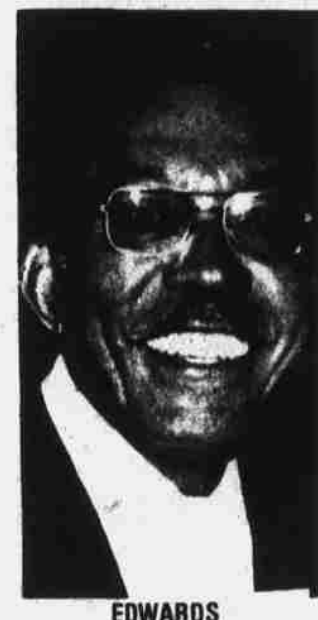
EDWARDS Funeral services for

You might send us a church bulletin that would indicate noteworthy news of your church happenings.