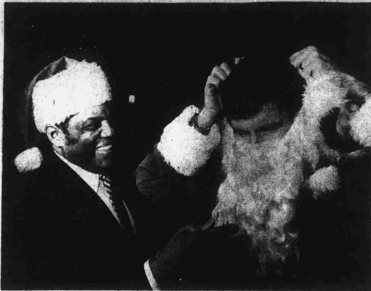
NEW YORK—Baseball great Willie Mays helps Yankee pitcher Tommy John with his Santa suit at Mamma Leone's. The baseball stars helped honor the winners of the Colgate Women's Games.

Mon-Fri. 8-5 Sat. 12-5 Sunday 1-4 410 Pilot Street Phone (919) 688-4346