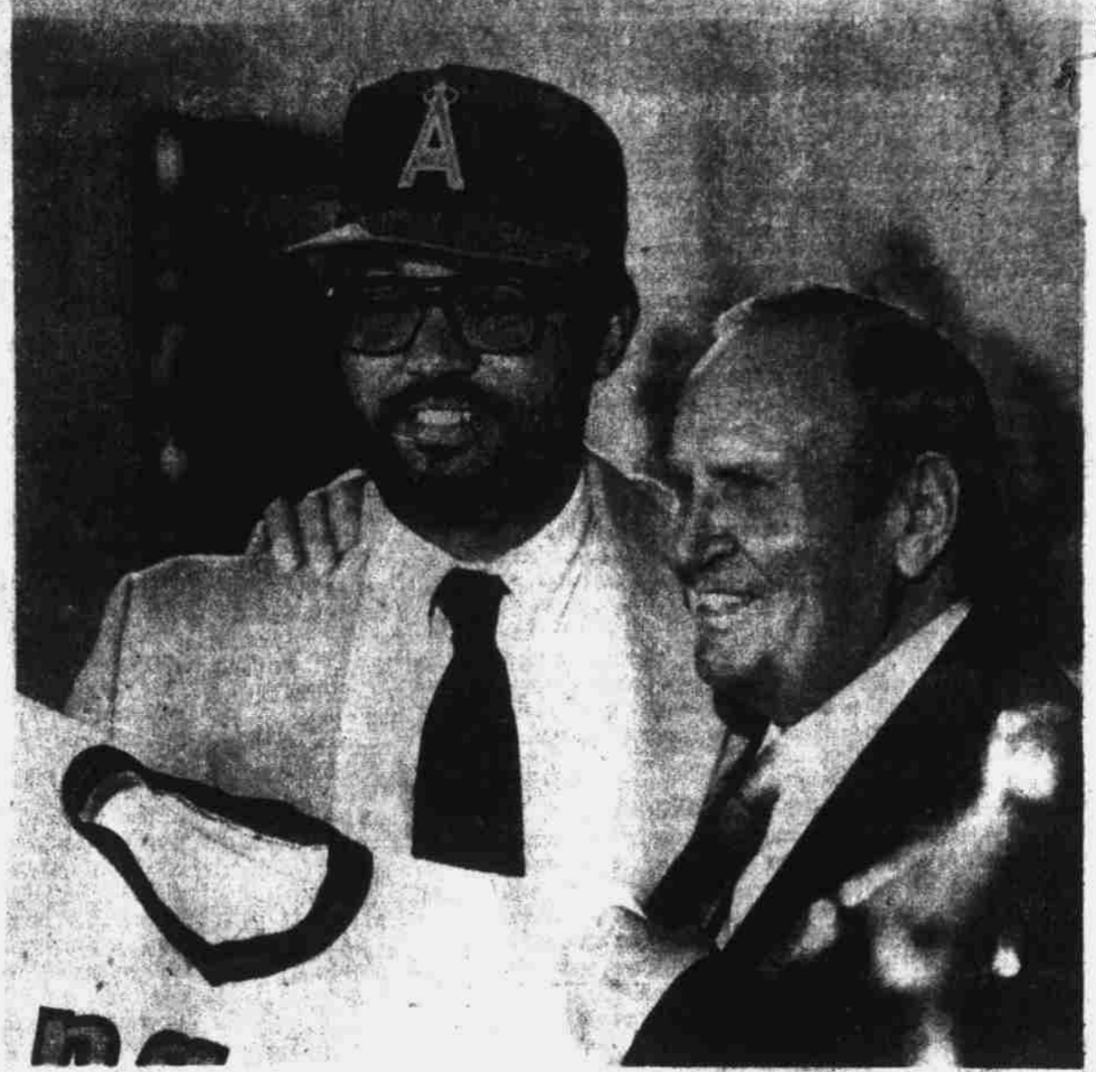
ANAHEIM, CALIF.—Wearing a new California Angels' cap, Reggie Jackson has a big smile for photographers at a press conference. Angels' owner Gene Autry has a big smile too after Jackson signed a four-year contract. Reggie, who played the last five seasons with the New York Yankees, said he doesn't plan to be a team leader with the Angels, but simply "one of the guys."