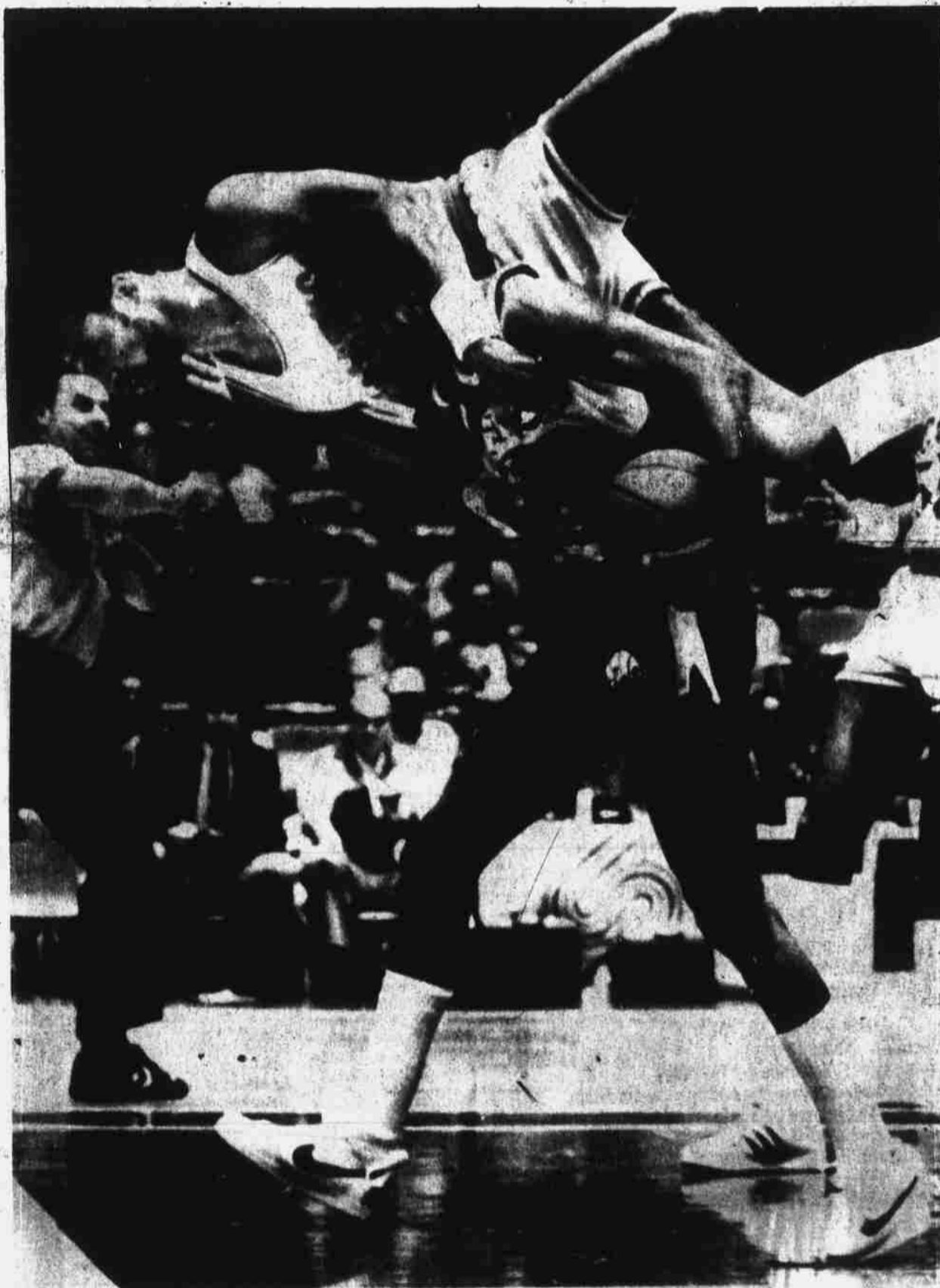
HOUSTON—The Houston Rockets were literally flying high over the Seattle SuperSonics, as Allen Leavell (top) proves to Seattle guard Gus Williams in this first quarter action of the game at the Summit. The Rockets won 117 to 100.