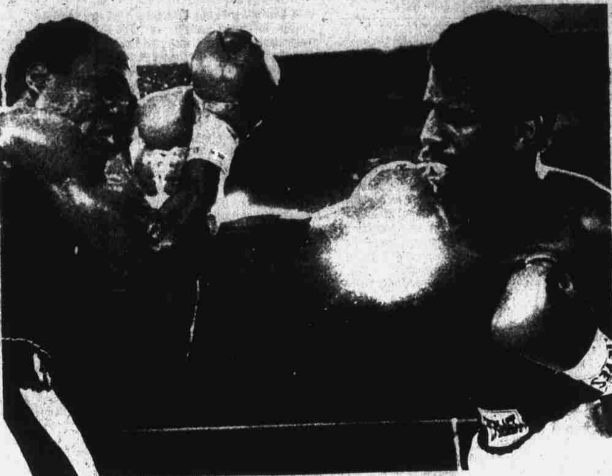
ATLANTIC CITY, N.J.—WBA light heavy weight champion Michael Spinks lands a overhand right to the face of challenger Mustapha Wassajal in the sixth round. Spinks retained his title with a knockout in the sixth round.