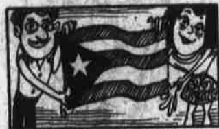
A model of the Puerto Rican flag was first developed in 1895.

Answers: Sacramento, Fresno, Oakland, San Francisco, Los Angeles, Inglewood, Burbank, Pasadena, Glendale, Alhambra, San Diego, Pomona, Monterey, Redding, Mendocino, Carpinteria, Ventura, Coronado, Stockton, Gilroy, Chester, Eureka, Klamath, Atwater, Merced, Delano, Brawley, Tulare, Sanger, Reedley, Dinuba, Lindsay, Wasco, Salinas 62