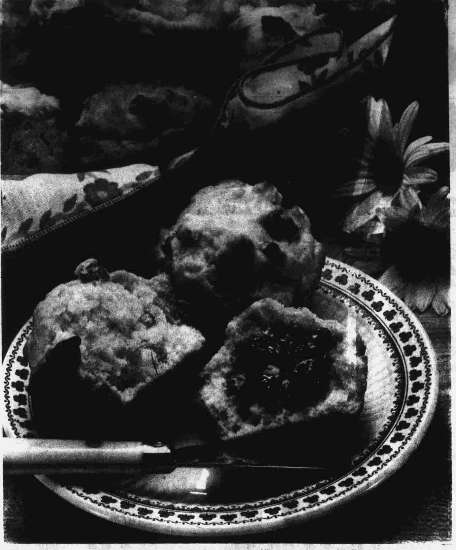
Apricot Chip Muffins