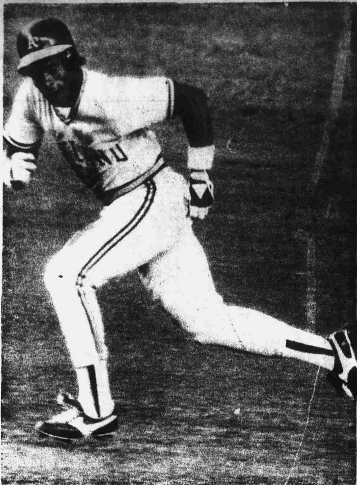
NEW YORK—And...Rickey Henderson is on his way. He dashes along the basepath in a bid to steal second during a recent game.