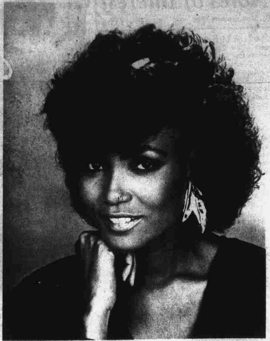
Casual Elegance: (left) the perfect accessory for day—the luxurious look of silky hair! A variation for evening excitement (right): a cascade of curls tamed with side combs. Lots of volume and soft texture...thanks to Gentle-Treatment.