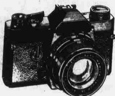
*Kodak & Minolta Cameras