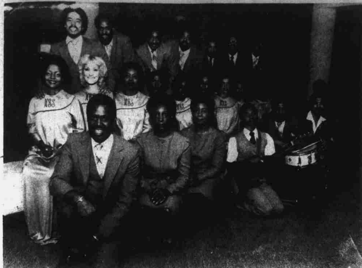
THE NEW GENERATION SINGERS