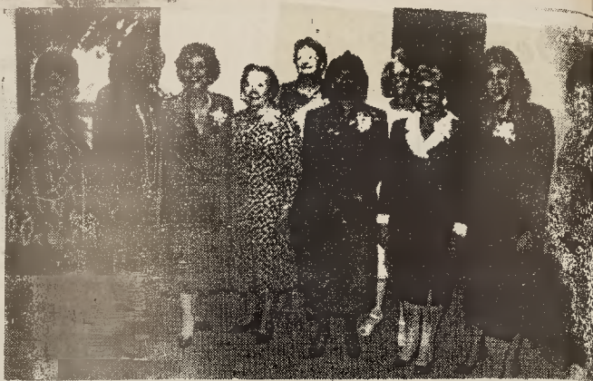
WIA PAST PRESIDENTS