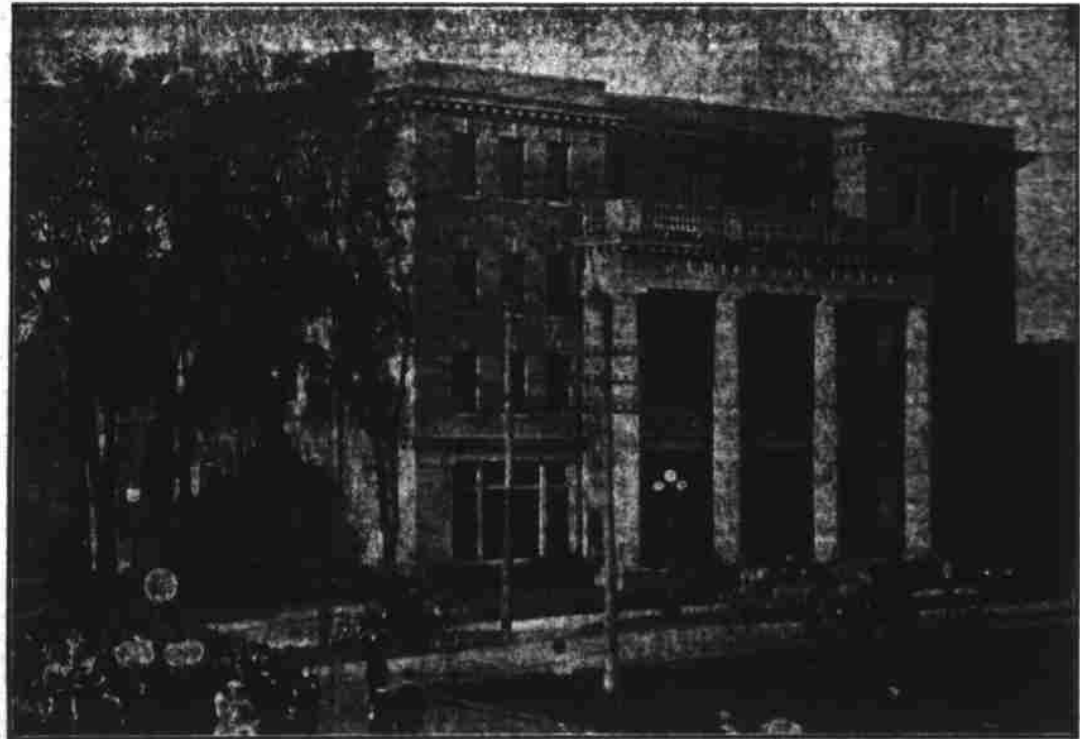
The Armington Hotel, Gastonia, N. C.

Gastonia, Feb. 17.—"Some cities near Gastonia," said a Gastonia prominent citizen today, "claims a large number of textile mills and publish their claims, but for some reason or other they never publish the names of the large number they claim in their city. Gastonia produces the names and the mills."