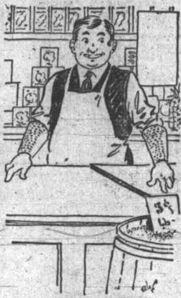
OUR LINE OF STAPLE

Thousands of people keep on suffering with Neuralgia because they do not know what to do for it. Neuralgia is a pain in the nerves. What you want to do is to soothe the nerve itself. Apply Sloan's Liniment to the surface over the painful part—do not rub it in. Sloan's Liniment penetrates very quickly to the sore, irritated nerve and allays the inflammation. Get a bottle of Sloan's Liniment for 25 cents of any druggist and have it in the house—against Colds, Sore and Swollen Joints, Lumbago, Sciatica, and like ailments. Your money back if not satisfied, but it does give almost instant relief.