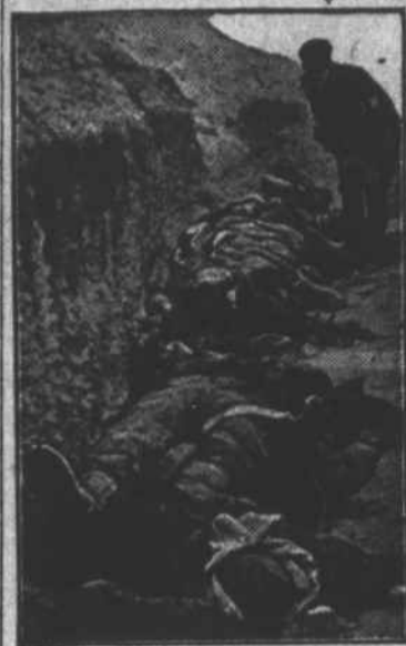
Dead Bodies Everywhere.

We had packed up, preparatory to departing, when a R. T. O. held up his hand for us to stop where we were and came over. This is what he said: