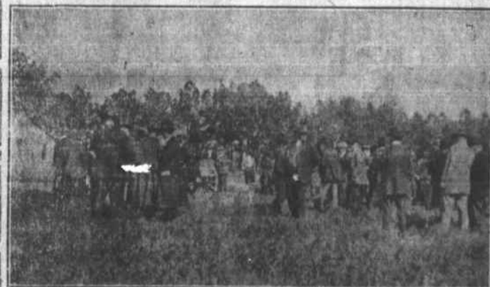
VIEW OF ONE OF OUR FARM SALES

If you have Farms or Lots to sell—write us. We will sell it to your advantage even if it is rented out for this year. The service we render our clients is complete in every detail. We make necessary improvements on property—sub-divide and attend to the publicity details of each sale.