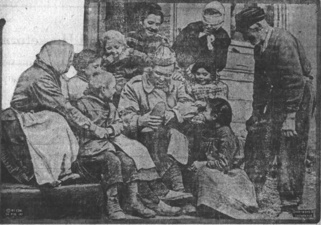
The American doughboy has earned the esteem and love of the peasants of France. In Brioules-sur-Bar the American chaplain shown in this picture is interested in a pair of wooden shoes while the peasants surround the friendly Yank endeavoring to show their appreciation for his deeds and make him at home.