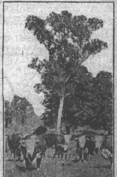
A High-Class Beef Breeding Herd.

Improve Each Generation. In profitable beef production a herd of good cows and a good purebred bull are of great importance. Each