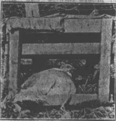
Turkey Hens Are Close Sitters.

About a week before the poultry are to hatch a sufficient number of turkey hens should be allowed to sit to take all the poult hatched. They can be given a few eggs from the incubator or from under the chicken hens,