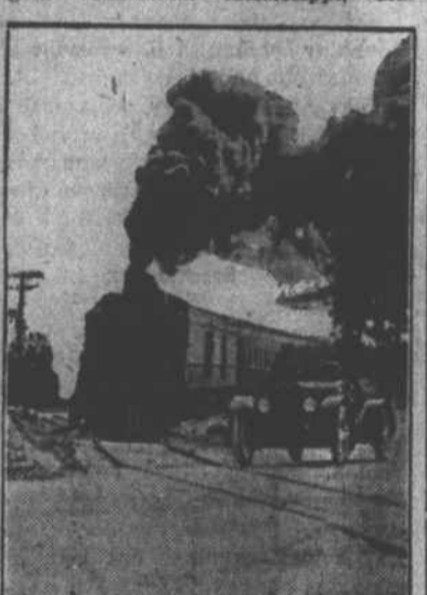
Accidents Are to Be Expected at a Grade Crossing of This Kind.

Projects approved during the three months ending September 30 are located in Alabama, Arizona, Arkansas, California, Colorado, Florida, Georgia, Idaho, Indiana, Kansas, Kentucky, Maine, Maryland, Massachusetts, Michigan, Minnesota, Mississippi, Missouri, Montana, Nebraska, New Hampshire, New Mexico, New York, North Dakota, Ohio, Oklahoma, Oregon, Pennsylvania, South Carolina, South Dakota, Tennessee, Texas, Utah, Virginia, Washington, West Virginia, Wisconsin and Wyoming.