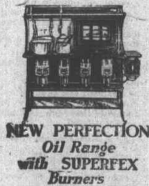
NEW PERFECTION Oil Range with SUPERFLEX Burners