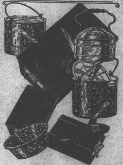
The Good Wife Deserves a New Majestic in her Kitchen

It lessens her work and worry. Its exquisite beauty great water heating and baking qualities give joy and happiness to the whole family, three times a day, every day in the year, for years and years to come. Certainly this is worth considering when you know the Majestic costs less per year than any other range on earth.