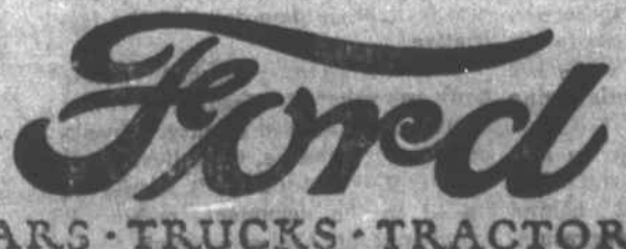
CARS · TRUCKS · TRACTORS