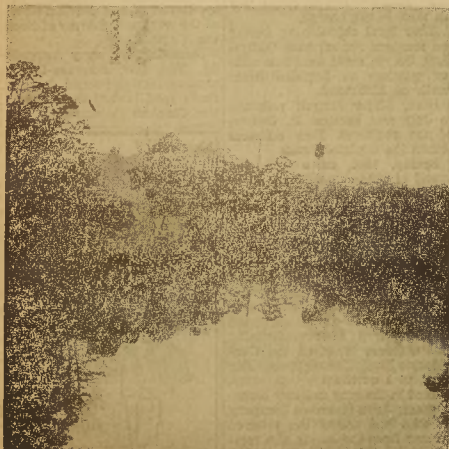
MEHERRIN RIVER—INDUSTRIAL-FUN FOCUS