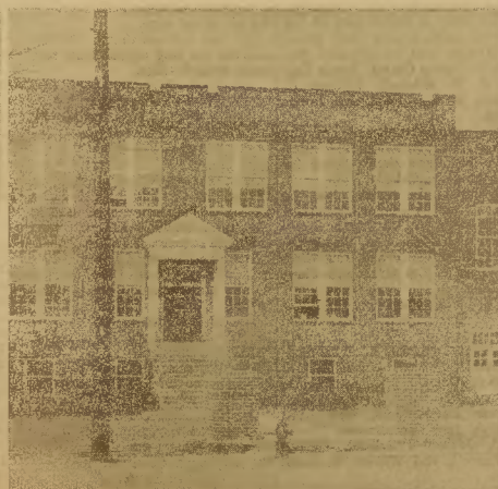
SCHOOLS—PRIDE OF COMMUNITY