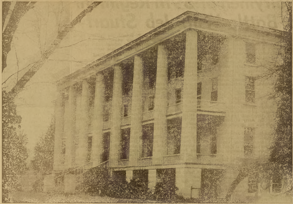
Chowan College's Columns, Symbol of Murfreesboro's Heritage