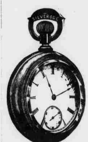
For fen Subscriptions.

But that is not all, we make another offer