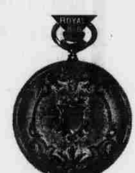
Bor Thirty-fixe Subscriptions.

or gan notal watch stem set, granateed for misus s 12 months, a good that keeper. To every person saiding as $8.00 with 8 subscriptions old or new we will give a