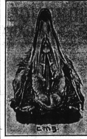
SECTION SHOWING ROOF OF MOUTH AND CLAW.

When fowls breathe air is drawn through the nostrils, passes down through the cleft in the roof of the mouth to the opening (larynx) of the windpipe (trachea) and thence to the lungs. A bubble at the nostril indicates cold. The watery discharge thickens