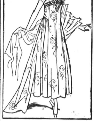
BERNARD'S BORGIA GOWN. He calls it Lucrece. It is of metal cloth in green and gold, brocaded with gold flowers. There is a train of gold lace which hangs from the waist.

French Street Suit. As long ago as last July, those who watch straws, rather than shop windows, insisted upon the fact that even street suits should maintain a straight silhouette. Every woman in France, smart and otherwise, had removed all manner of stiffening from her skirts as early as July and allowed the fullness to fall into the figure as softly