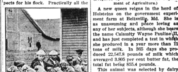
Sheep Club Members Exhibiting Their Animals.

Calamity Wayne Pauline II Completes Year Test, Producing Eleven Tons of Milk. (Prepared by the United States Department of Agriculture.) A new queen reigns in the herd of Holsteins on the government experiment farm at Beltsville, Md. She is as unassuming and peace loving as any of her subjects, although she bears the name Calamity Wayne Pauline II, and has just completed a test in which she produced in a year more than 11 tons of milk. In 365 days she produced 22,547.8 pounds of milk which averaged 8.805 per cent butter fat, the total fat being 855.4 pounds. This animal was selected by dairy specialists of the United States department of agriculture from a Michigan herd in July, 1917. She was brought to the Beltsville farm, where she produced a heifer calf, and was started on her test December 7, 1917, at the age of eight years. The test was run through the coldest winter that section had experienced in 40