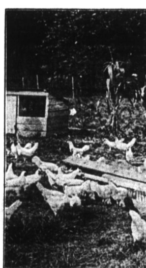
Growing Chickens Feeding Themselve

One of the most important factors in keeping young chicks growing is