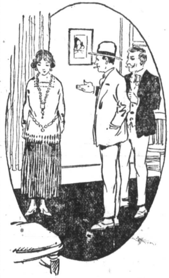
He Could Buy Her for $850.