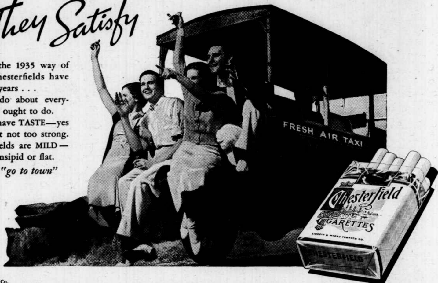
© 1935, LIGGETT & MYERS TOBACCO CO.