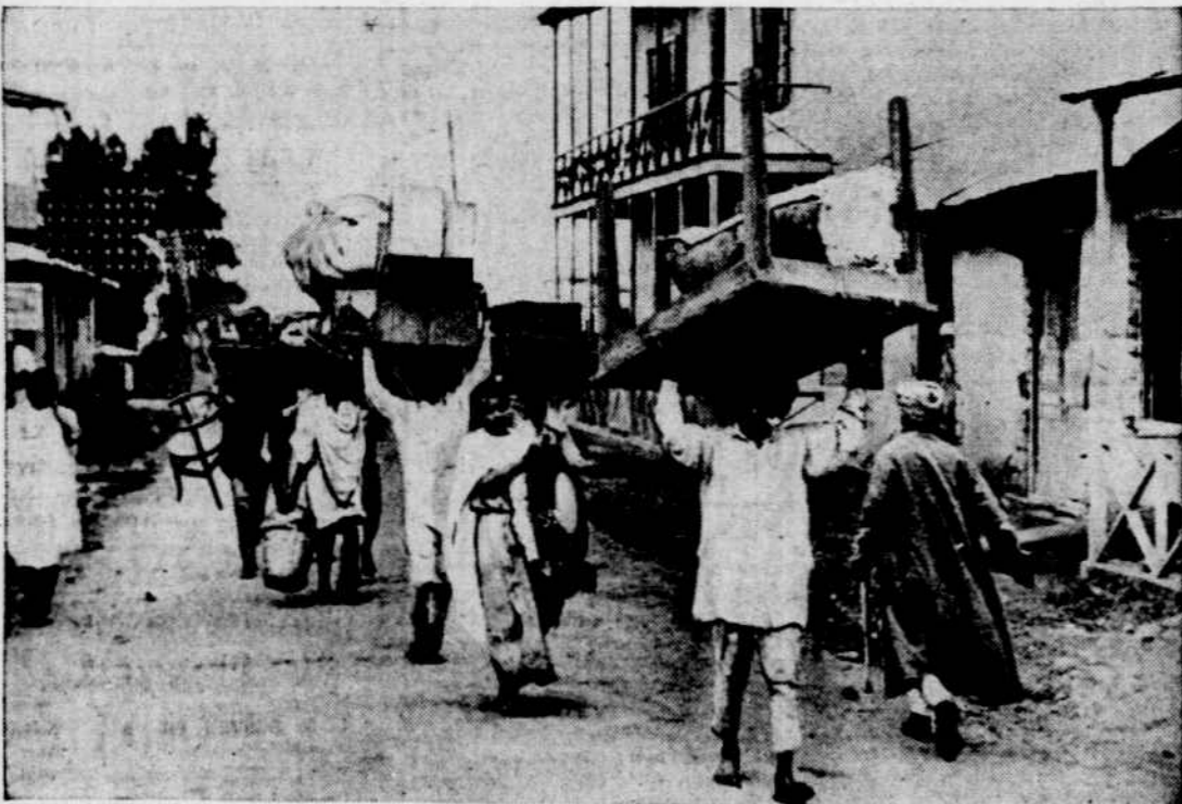
Carrying many of their possessions balanced on their heads, these natives were evacuating Addis Ababa in preparation for the coming invasion of Italian troops. It was part of Ethiopia's war plan to deconcentrate the dwellers in many of the capital's crowded neighborhoods, to reduce the effect of a possible air raid.