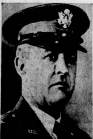
He succeeds Gen. Douglas MacArthur, who has gone to the Philippines.

Maj. Gen. Malin Craig has been appointed chief of staff of the United States army with the rank of general.