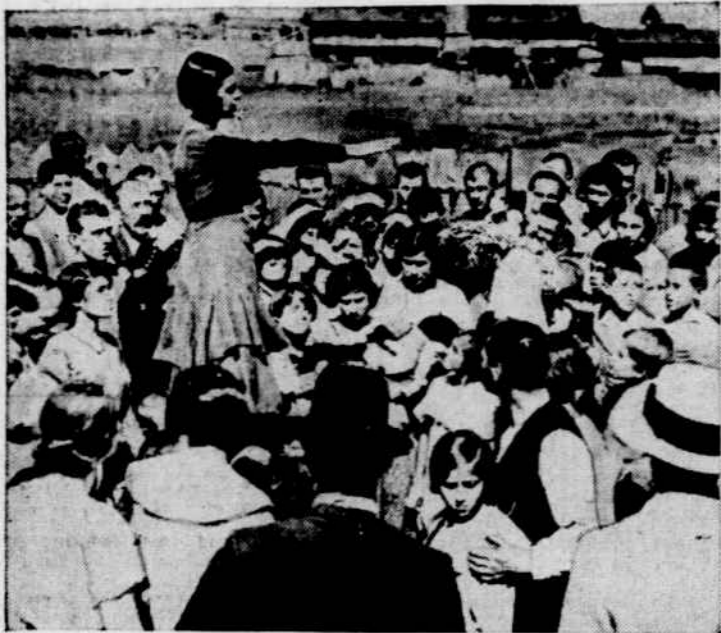
Rumania may develop another Joan of Arc, for a young girl there is availing herself of a vision in which the Virgin Mary came to her. She is here seen talking to a throng on the spot where she had the vision and where a shrine is to be erected.