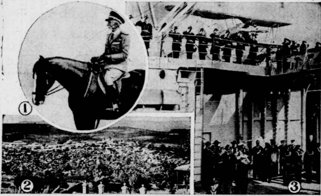
1—Gen. Emilio De Bono, commander of all the Italian troops in the campaign against Ethiopia. 2—View of the city of Harrar, objective of Italian troops invading Ethiopia from the south. 3—President Roosevelt boarding the cruiser Houston for his trip in the Pacific and through the Panama canal.