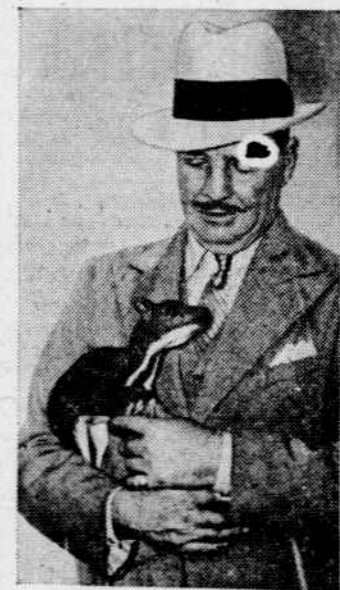
kind in captivity. It is housed in his zoo at Amityville, L. I. Buck says it's a real trick to "bring 'em back alive" when it's the diminutive mouse deer you're after. The animals Buck had at the Chicago Fair are also on Long Island.

Frank Buck, noted big game collector, holding what is considered the world's smallest deer, known as the mouse deer, and the only one of its