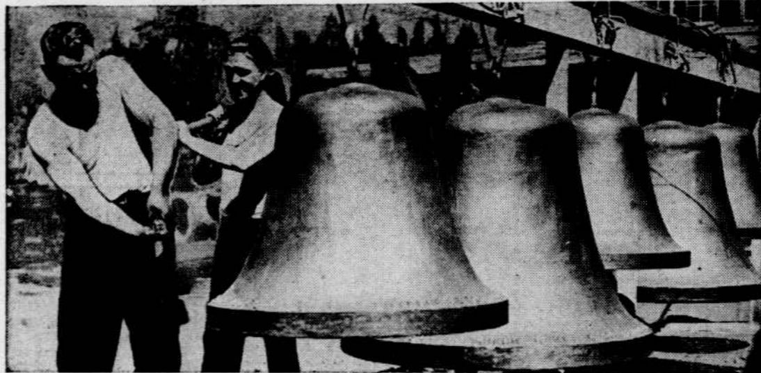
One of the many safety measures to be installed on the gigantic San Francisco-Oakland bay bridge is a group of five huge bells, one for each tower and the central anchorage. The bells, largest ever made in western America, have been undergoing tests in a San Francisco foundry for tone and carrying power. Workmen with sledge-hammers are seen pounding them. Each bell is of a different pitch and when installed they will resound over the bay like giant chimes.