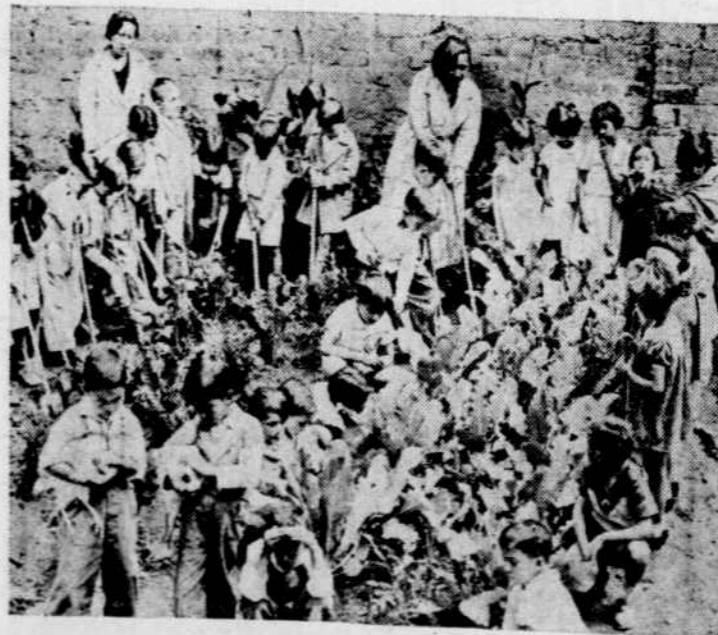
In keeping with its policy of socialistic education the Mexican government is opening new schools to teach the children the elements of agriculture. Vegetables are raised from seed by the small farmers on land allotted to the schools and worked co-operatively by the children.