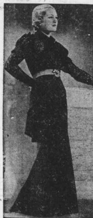
The cutaway is feminized in this charming gown of navy blue, wool lace from Goupy-Rosine, Paris. A coral suede belt with a coral and gold buckle adds a bright note.