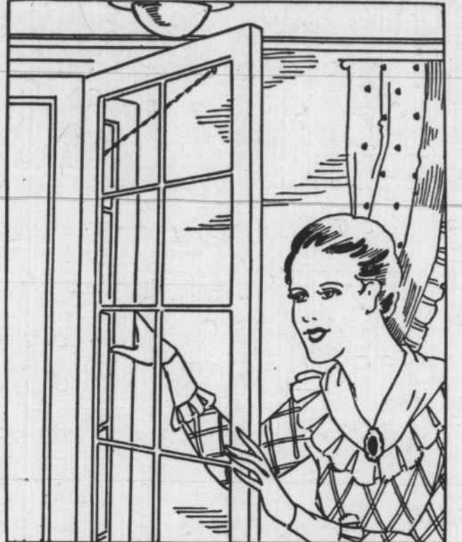
The Chain Keeps the Glass Door From Hitting and Breaking the Light Globe.

THE homemaker can, by simple devices, save her furniture and furnishings from getting marred and at the same time protect paint and wall paper in her rooms. Also in similar ways she can guard against breakage, and entanglements of door fastenings that are annoying rather than disastrous. For example, door stops can be made to do more than prevent doors from hitting the wall, and lengths of chain can be put to unusual uses of protection against accidents.