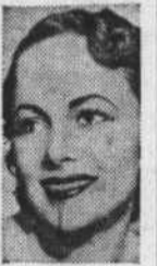
Olivia de Haviland

Not since the days of the Talmadge sisters long ago, have film fans had the fun of watching sisters climb to fame as screen rivals. Now everyone is arguing about the respective talents of Olivia de Haviland and Joan Fontaine. They are sisters, you know. And although Olivia had a big start, appearing in four Warner Brothers pictures before Joan went to work at RKO, there are many who think that by this time next year, Joan will be well in the lead.