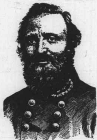
Thomas Buchanan Read

Whittier's poem appeared in the October, 1862, issue of the Atlantic Monthly. Almost immedi-