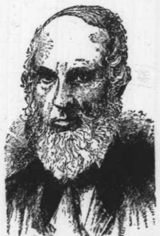
John Greenleaf Whittier

Immediately an officer rode up, saying "Granny, give me your flag." "You can't have it," replied Dame Barbara, then noticing the gray uniforms, she began waving it more energetically than ever. The officer spoke to his men and they turned facing her. For a moment she believed that they were going to fire on her, but she continued to wave her flag.