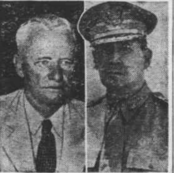
Admiral Nimitz, left, and General MacArthur.

One school of thought here believes that Japan will not stand the bombing, the loss of her cities and