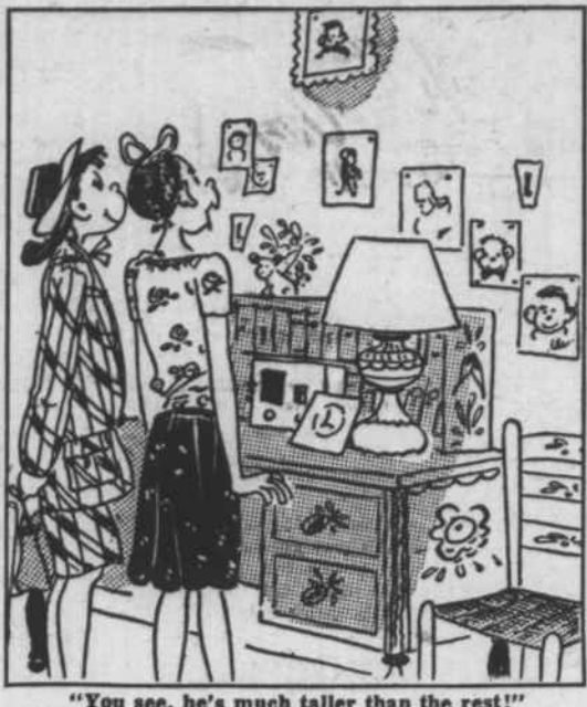
"You see, he's much taller than the rest!"