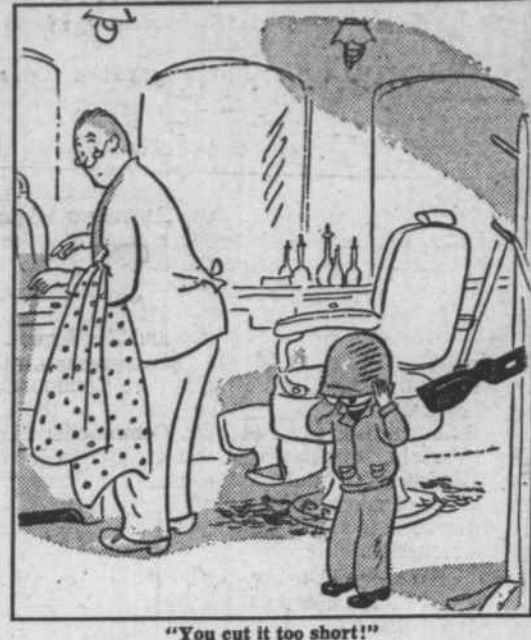
"You cut it too short!"