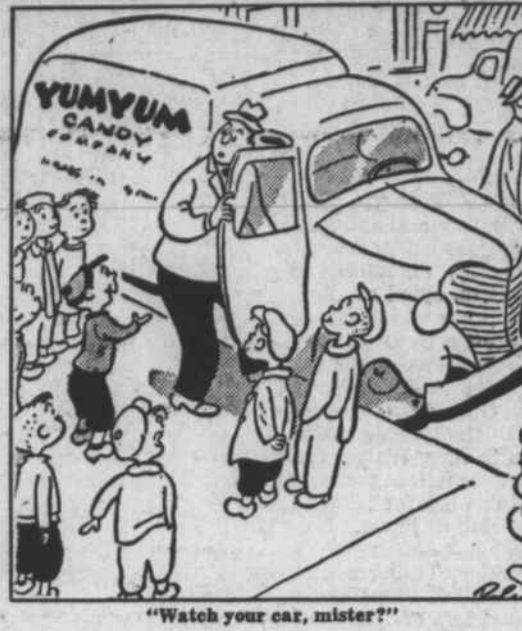
YUMYUM CANDY COMPANY "Watch your car, mister?"