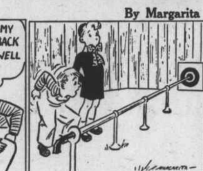
LITTLE REGGIE BUT I CAN'T HIT ANYTHING! HIT THE TARGET 5¢ YOU CAN'T MISS AH BUT IN MY GALLERY YOU'LL HIT THE BULL-EYE EVERYTIME DOUBLE YOUR MONEY BACK IF YOU MISS! DOUBLE MY MONEY BACK EH? - WELL OK!! By Margarita