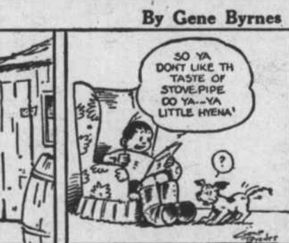
REG'LAR FELLERS FOR PETE'S SAKE STOP SNAPPIN' AT MY ANKLES AN' LET ME READ! PUPPIES ARE CUTE BUT THEY SURE ARE A PAIN IN TH' NECK-- I MEAN ANKLES-- FOR A WHILE!! THERE OKTER BE SOMETHIN' IN THIS OLE SHED I KIN USE FOR PROTECTION! SO YA DON'T LIKE TH TASTE OF STOVEPIPE DO YA--YA LITTLE HYEH!