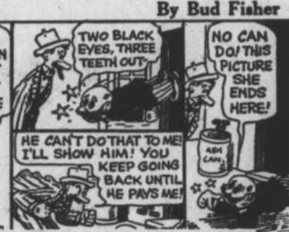
MUTT AND JEFF JUST GO UP AND TELL SPIKE YOU CAME TO COLLECT THE THREE BUCKS HE OWES ME! I'D GO MYSELF BUT HE DOESN'T LIKE ME! WHAT DID HE SAY? NOTHIN' WHEN I TOLD HIM WHO I WAS HE THREW ME DOWN THE STAIRS! YOU GO RIGHT BACK UP AGAIN! HE DON'T SCARE ME! DANG IT! GO UP AGAIN AND INSIST YOU WANT MY THREE BUCKS! TWO BLACK EYES, THREE TEETH OUT NO CAN DO! THIS PICTURE SHE ENDS HERE! HE CAN'T DO THAT TO ME I'LL SHOW HIM! YOU KEEP GOING BACK UNTIL HE PAYS ME!