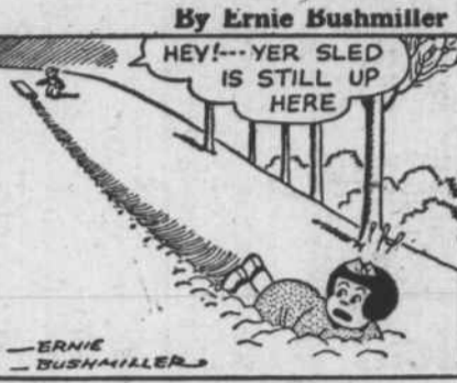
NANCY HEY!...D' SNOW IS PRETTY DEEP THAT'S THE WAY I LIKE IT! WHEEE THIS IS THE BEST RIDE I EVER HAD HEY!...YER SLED IS STILL UP HERE By Ernie Bushmiller