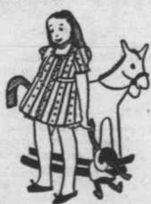
Make your daughter a dress.

Another big help is to do your cutting all at one time, and the sewing or machine work at another sitting. You can even cut several dresses from the same pattern at one time, and don't worry about monotony in style. There's a good deal of variety in fabrics, so you don't need to worry about their being look-alikes.