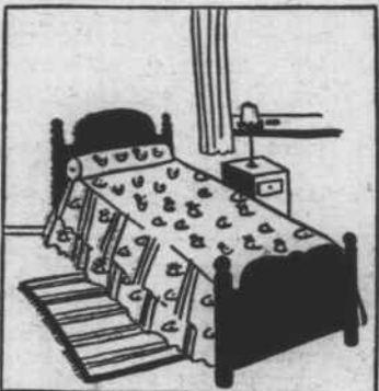
If you have a worn-out bed spread...

If you are using a piece of old material as suggested, and it has