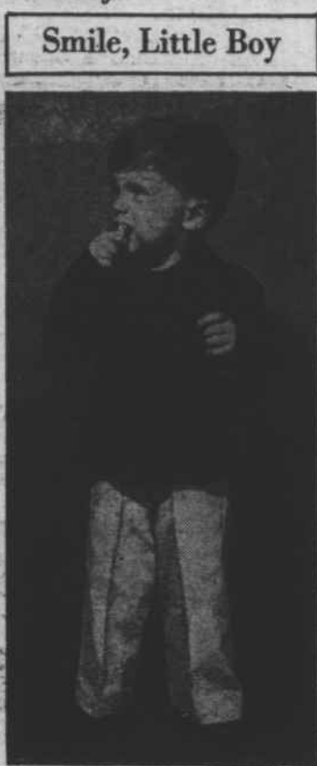
This little gentleman doesn't have to be so self-conscious because he's well turned out in a two-piece ensemble of kiduro, the new corduroy that can take a beating such as only a youngster can give it.

For suits for the week-end out of town, wear something fetching at the neck of your suit. Rippling ruffles are feminine and charming.