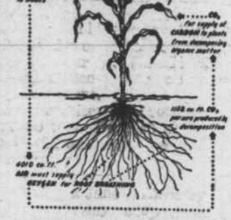
Carbon dioxide released daily at the above rates will provide carbon for plants yielding at 80 bushels per acre.

"Ventilation requirements of a good soil with a high organic matter content, are based on the escape of approximately 1,100 cubic feet of carbon dioxide gas daily from each acre in a corn or tomato field dur-