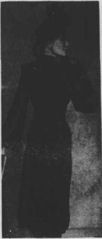
This intriguing version of a fall suit by Browne has a double-breasted jacket softly shirred at the hips. The sleeves widen at the turned-back cuff. The material is red wool, trimmed with gold buttons.

ished in place with neat, small stitches.