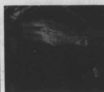
Kudu responds to 2,4-D treatment.

Working different from most herbicides, 2,4-D seems to affect the growth mechanism of the plant and