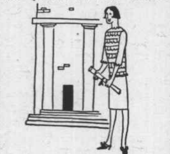
If you have an out-dated graduation dress . . .

A collarless suit is just as much of a problem . . . for whatever