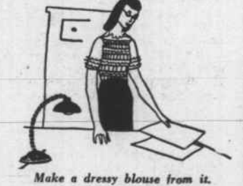
Make a dressy blouse from it. may be joined with a neckband. In some cases, the collar needs neither of these, the part of the collar which is joined directly to the neckline being made somewhat longer. This is then folded under and finished.

Collars may be joined to the blouse with a bias strip of the same material as the blouse; or, they