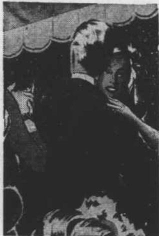
A tall broad-shouldered man dancing quietly with a tall blonde girl.

"He was the quarter-back, but he was also our line-bucker. Every-