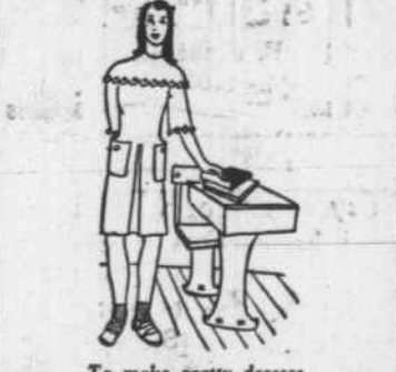
To make pretty dresses.

Lay out the pieces of your pattern on the material before you do any cutting whatsoever. The fabric guide of the pattern will not be of too much help, inasmuch as you are using material which will not fit regulation yard lengths. Do not cut until you have fitted everything together and then pinned the pattern to the fabric. Pinking shears are ideal for finishing the edges of this cotton material.