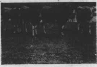
Good health, good cows, good milk on well fertilized pastures.