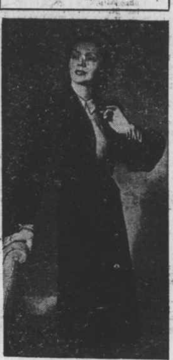
Typical of Hansen Bang's flair for the bolero is this wine woad suit worn with a pink tufted crepe blouse.

and require rather high style to set them off properly. For the present season you might like to make them into a lovely suit perhaps with a modified bustle.