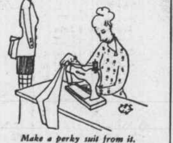
Make a perky suit from it.

Just as you select a new dress for its appropriate material, you must consider material when remodeling. I think you will find that old taffeta and satin formals can be made into bright, perky suits either for yourself or a teen-age daughter.