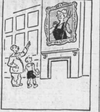
That's your grandfrop, son. He raised a record crop of soybeans back in 1943.

A concrete livestock watering tank is watertight, furnishing an ample supply of fresh water in readily accessible troughs.