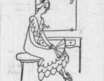
If you have an old formal...

If you have an old velvet formal or dinner dress of prewar vintage, you may be delighted to discover that the velvet is of an exquisite quality. Restore it to life by steaming, or have it cleaned professionally.