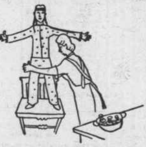
Make children's clothes at home.

Fabrics for pajamas and nightgowns should be selected primarily for their durability and ease of washability. Any of the fabrics named previously will do the job thoroughly. Unless you really have time to spare, these fabrics need not be ironed before wearing. Just