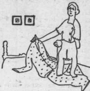
If you want to economize . . .

Here is a wonderfully simple way for making nightwear. First of all, have patterns and material ready