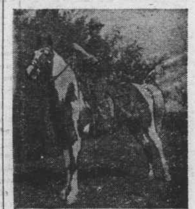
Ideal type of Morocco spotted horse.

1,050 to 1,400 pounds. It is a general purpose horse, bred for work as