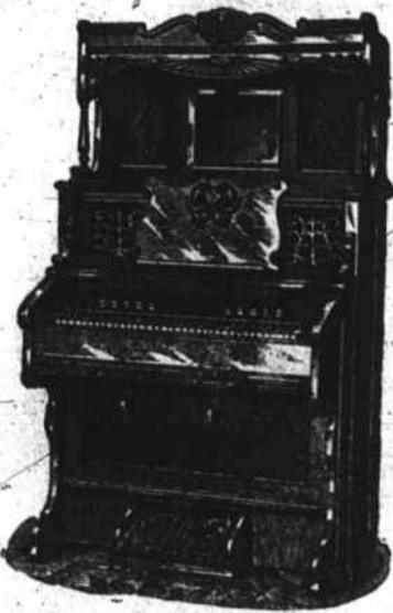
Pianos and Organs