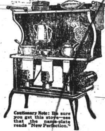
Caution Note: Be sure you get this stove - see that the name-plate reads "New Perfection."

entirely removes the discomfort of cooking. Apply a match and immediately the stove is ready. Instantly an intense heat is pro- jected upwards against the pot, pan, kettle or boiler, and yet there is no surrounding heat - no smell - no smoke.