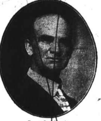
From a Late Applicant