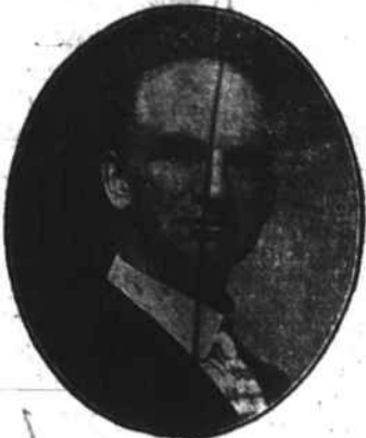
From a Local Newspaper